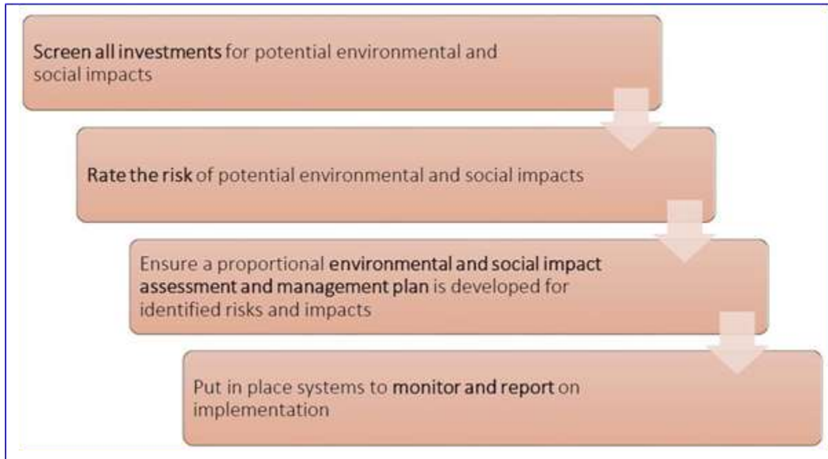
Fig 1: Demonstration of the adherence to the ESS process

The following flow chart describes the process of ensuring that the ESS process is adhered to: