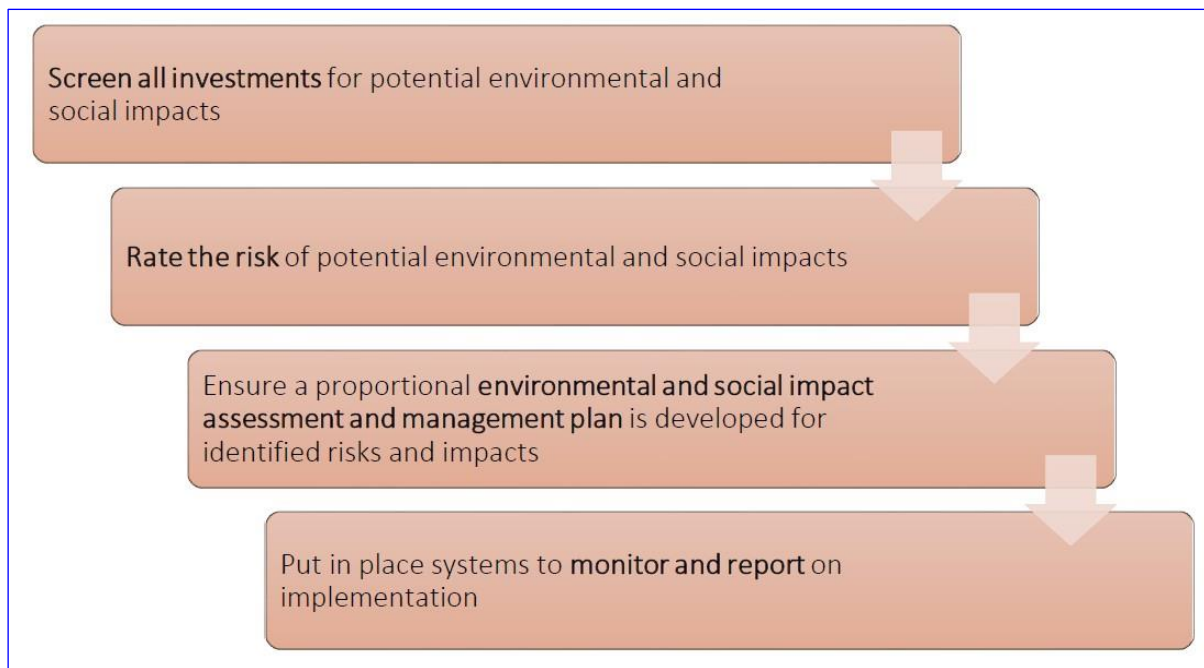
Fig 1: Demonstration of the adherence to the ESS process

The following flow chart describes the process of ensuring that the ESS process is adhered to: