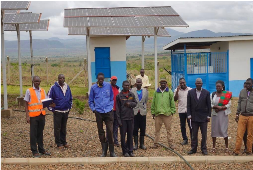
Technical visit to Lokolia water supply with a team from Kaabong district