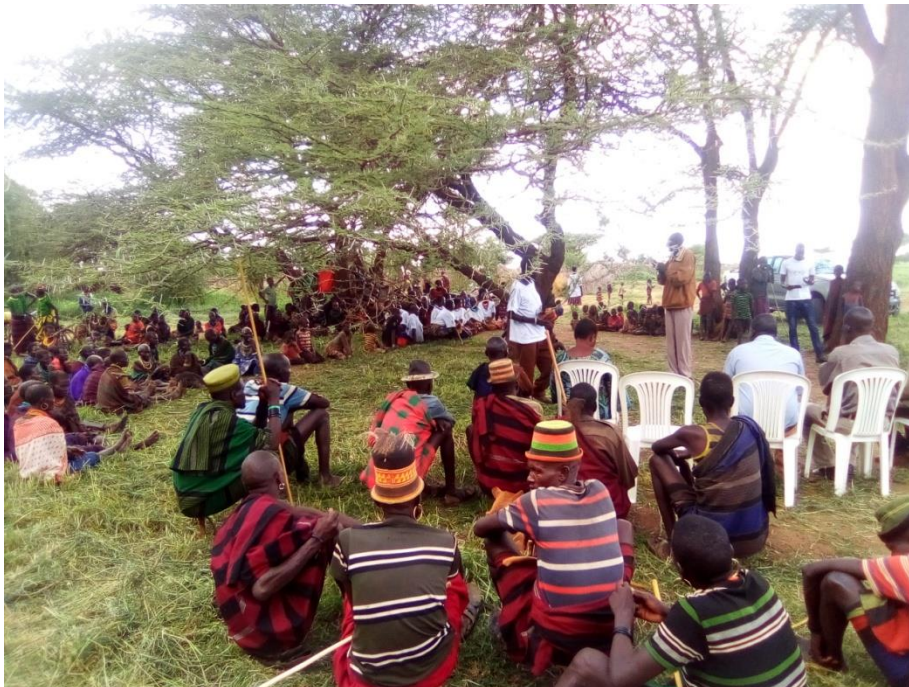
Community stakeholder engagement in Rupa sub county Moroto district