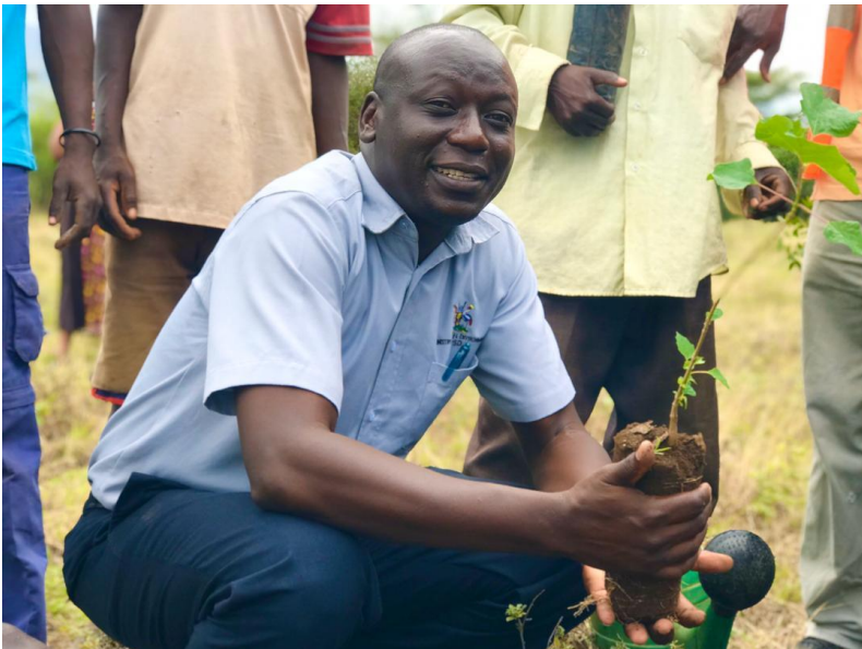
Manager UWS-K planting trees in one of the schemes