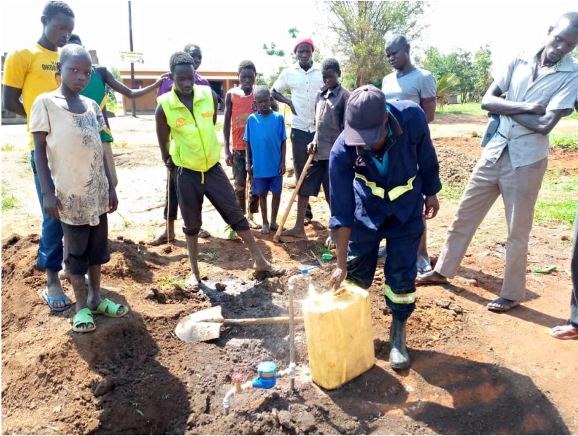
New water connection made in Orwamuge water supply