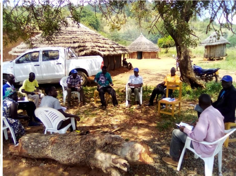
WSSB meeting in Morulem water supply -Abim district