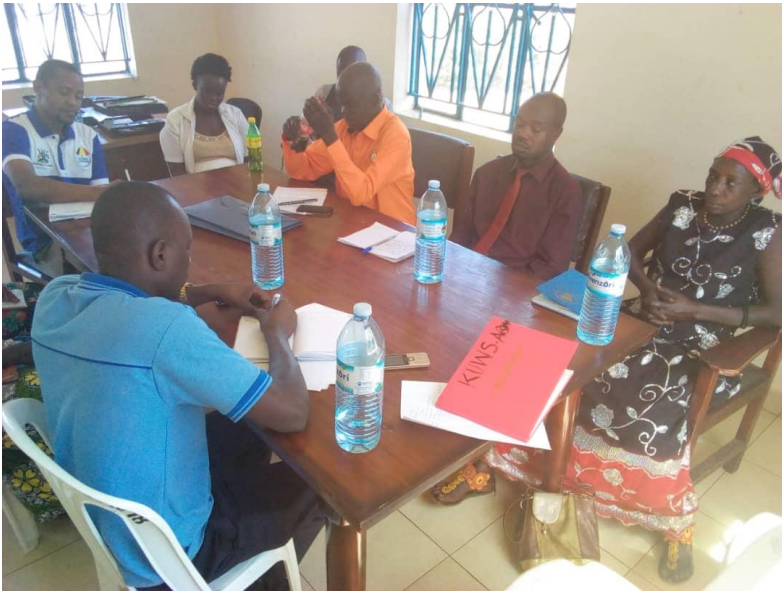
WSSB meeting in Abim TC