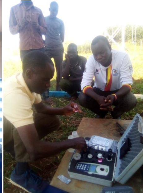
Capacity building to scheme operators in water treatment and water quality monitoring.