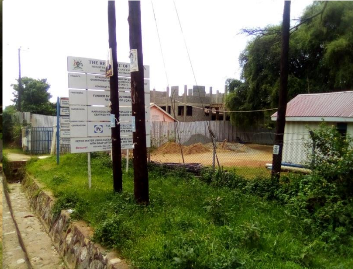
MWE regional Office block under construction in Moroto district