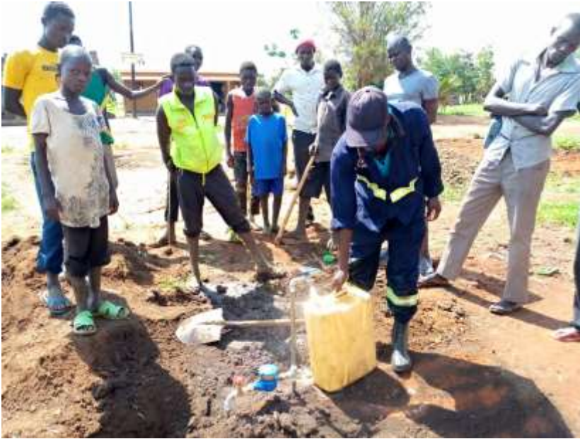
New water connection made in Orwamuge water supply