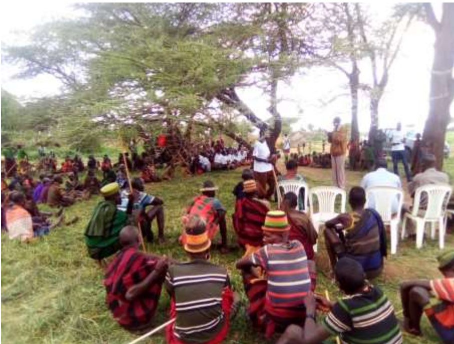
Community stakeholder engagement in Rupa sub county Moroto district