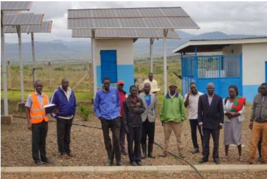
Technical visit to Lokolia water supply with a team from Kaabong district