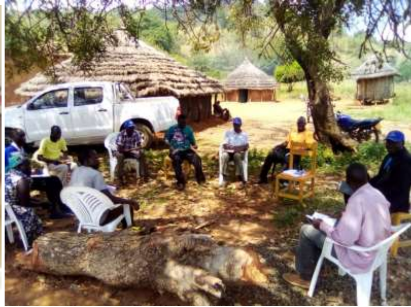
WSSB meeting in Morulem water supply -Abim district