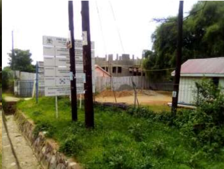
MWE regional Office block under construction in Moroto district