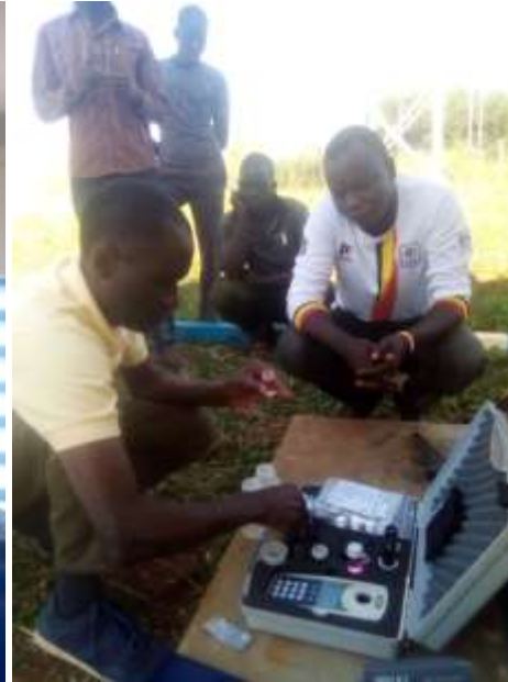
Capacity building to scheme operators in water treatment and water quality monitoring.