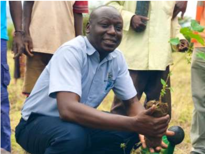
Manager UWS-K planting trees in one of the schemes