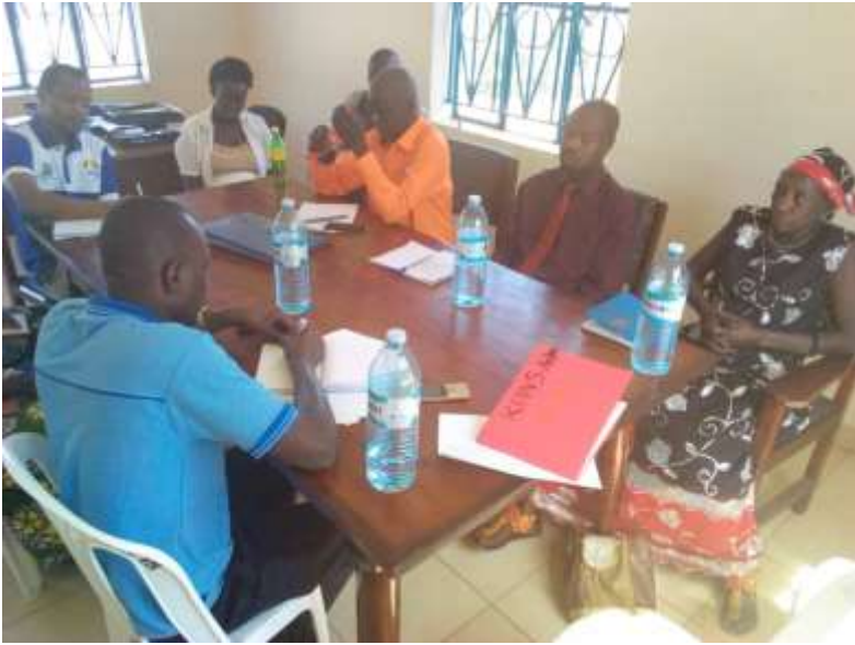
WSSB meeting in Abim TC