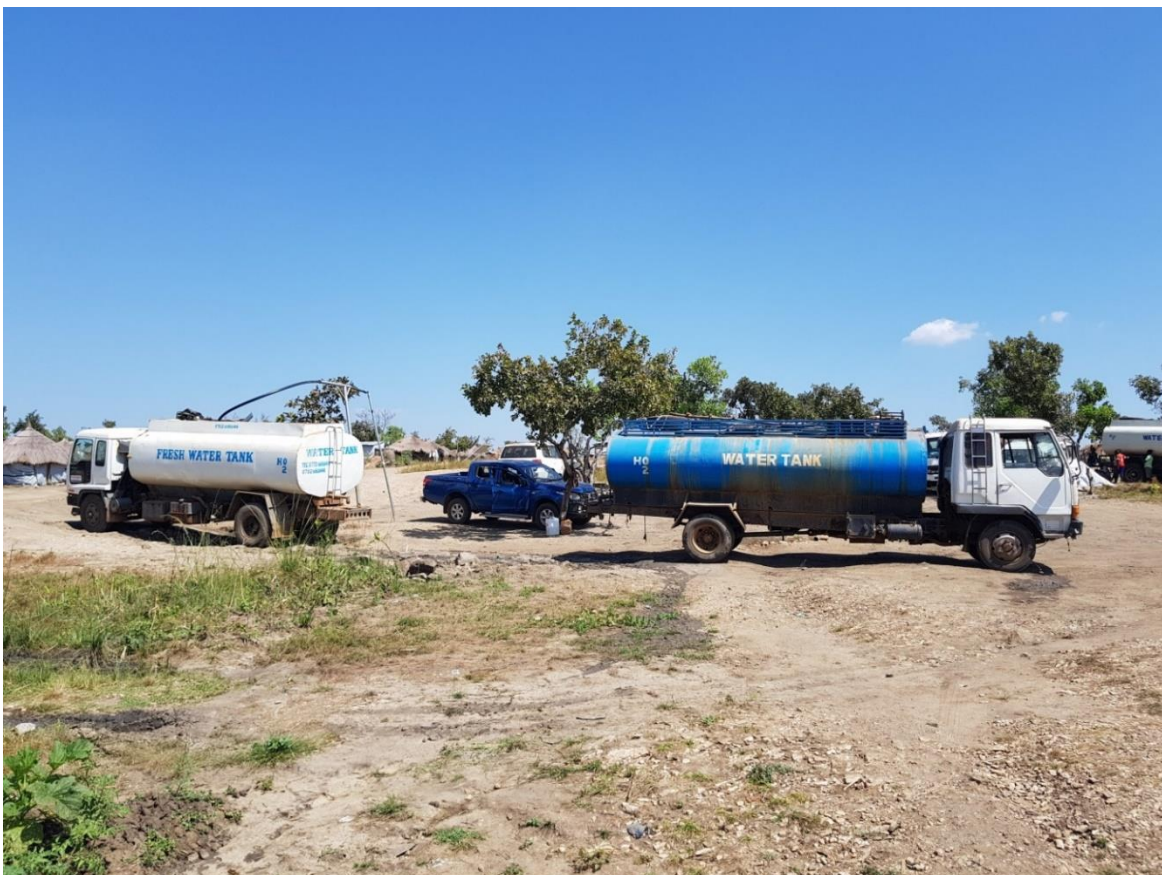
Figure 1: Water Trucking in Zone 3, BidiBidi in Kululu SC Yumbe District (Dec. 2017)

The inadequate water supply was supplemented by trucking water from far off distances. By October 2017, 81% and 37% of water supplied to Imvepi and Rhino settlements respectively in Arua was by trucking. More than 33% of water delivered in Palorinya settlement in Moyo, BidiBidi in Yumbe and Palabek in Lamwo was by trucking. It should be noted that currently, refugees do not pay for water services provided within the settlements.