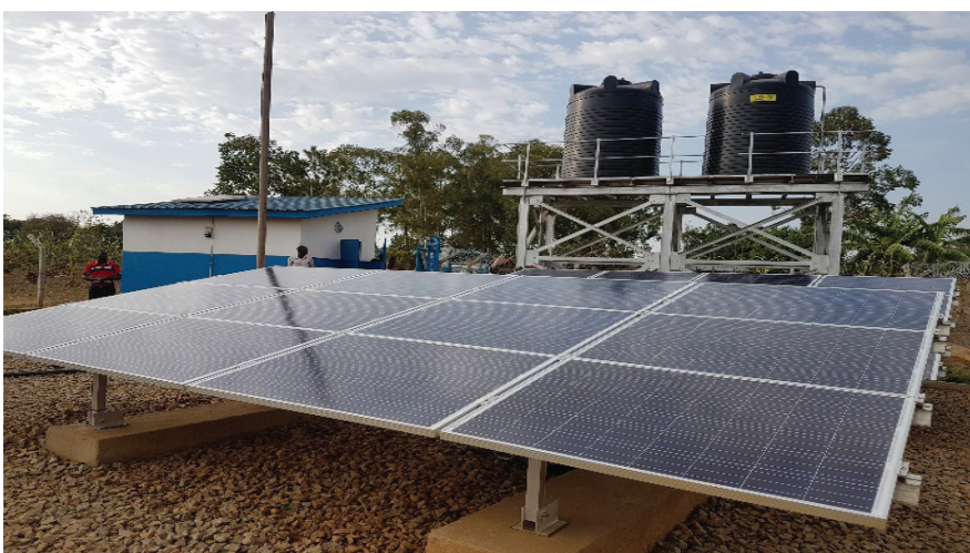
The Kiwangara Solar Powered Mini-Piped Water Schemes implemented by the Rural Water Supply and Sanitation Department in Lwengo District