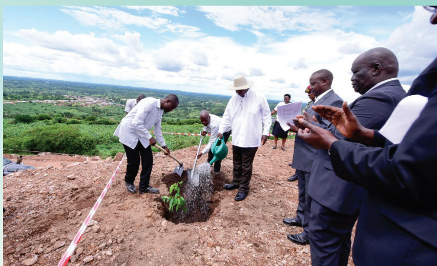
HE President planting a tree during the ground breaking of Kikyenyeky-Nabuhiky GFS in Ibanda district as the Ministry officials look on