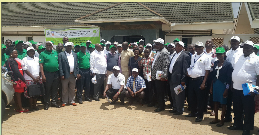
The launch of the EURECCCA project