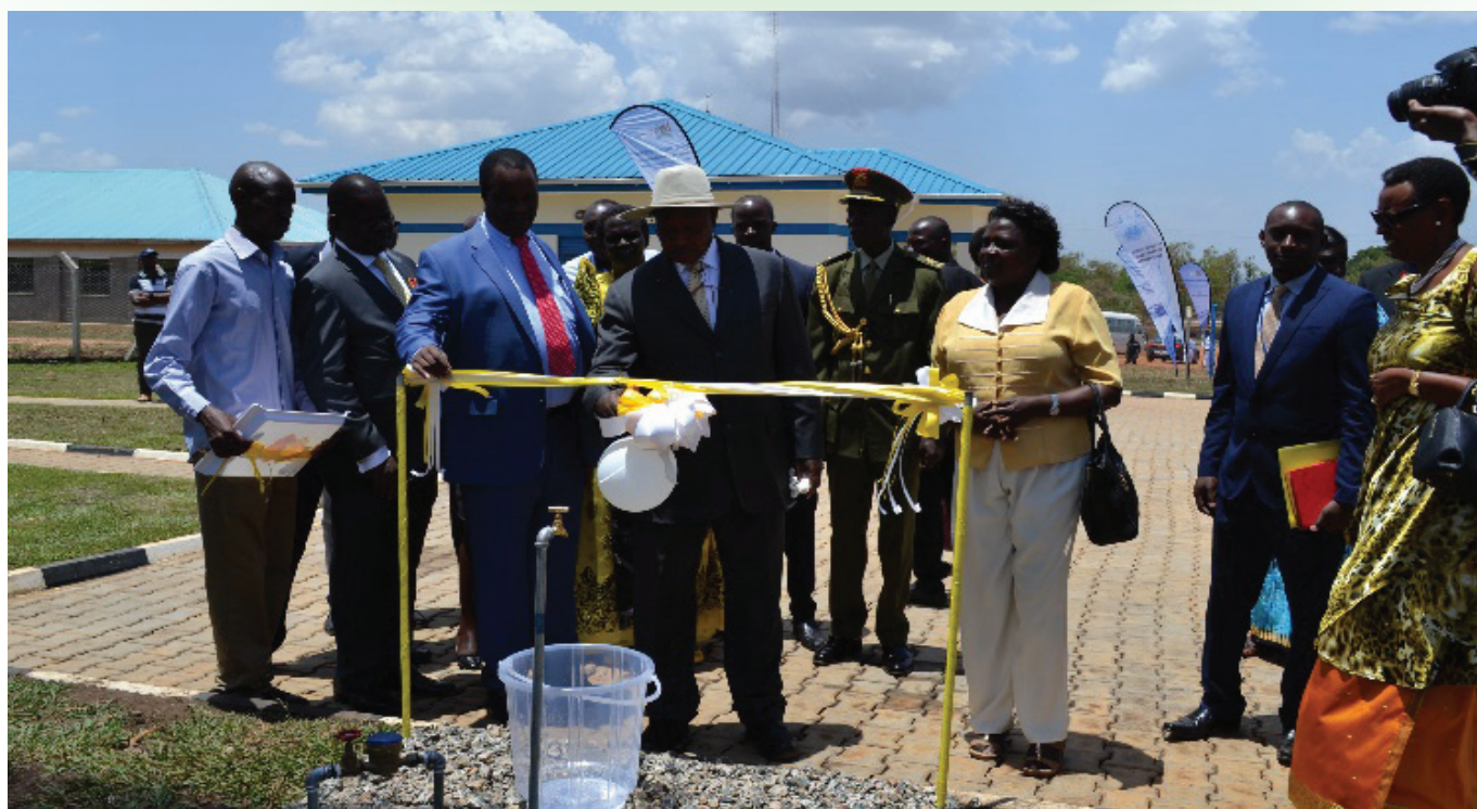
H.E Yoweri Kaguta Museveni commissioning Dokolo water supply system in Dokolo District

In the Eastern Region piped Water Supply and Sanitation systems are serving an additional population of 136,586 people through 1,185 No.