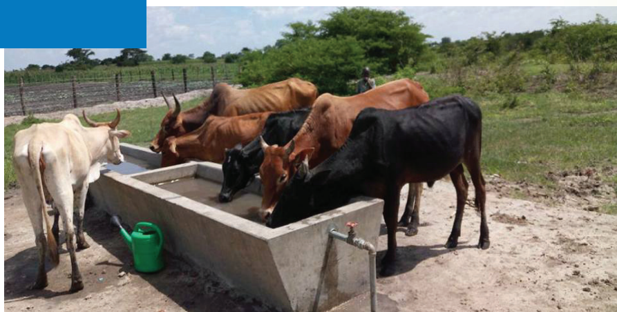
1. Iwemba Valley tank and Irrigation Scheme in Bugiri District

Environment (MWE) reforms, and in response to wide consultations that pointed out the need to address issues of increasing pollution, climate variability, and reduction in water availability, and to balance water needs for agriculture, energy, industry and households in the country.