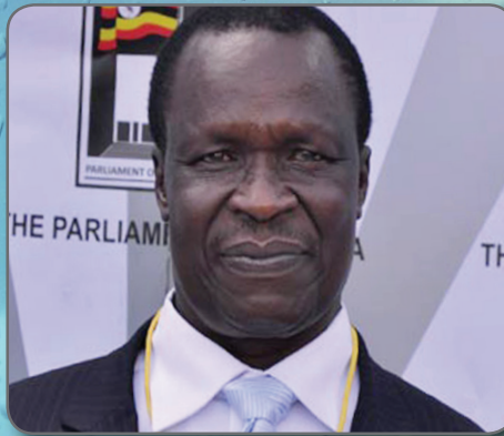
Hon. Samuel Cheptoris Minister of Water and Environment