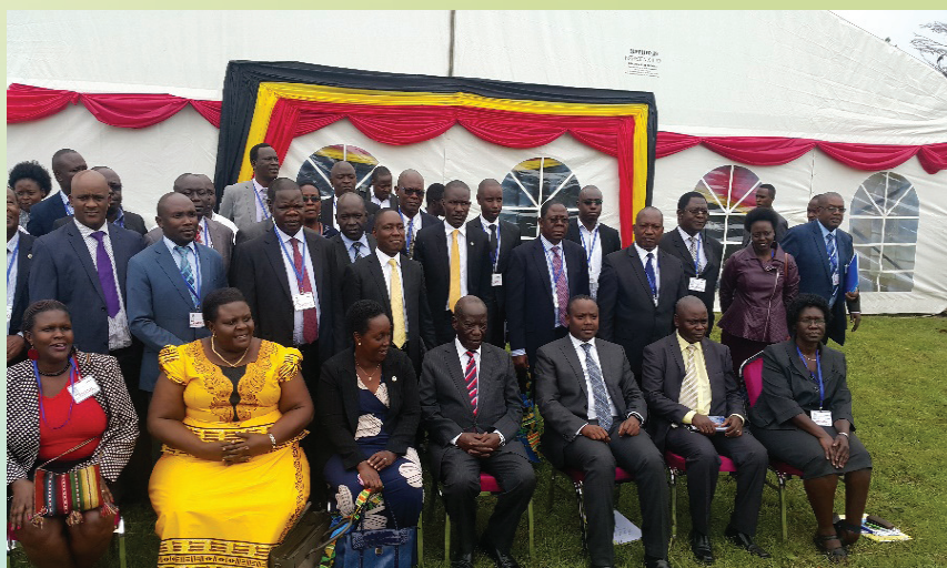
Vice President Hon. Edward Ssekandi the Chief Guest in a group photo during the opening of the Uganda Water and Environment Week 2018