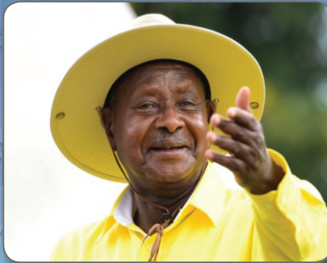
H.E. Y. K. Museveni President of the Republic of Uganda