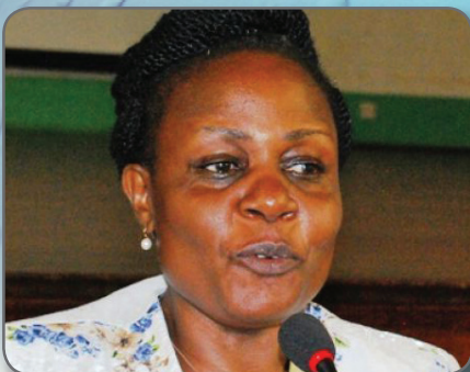
Hon. Kitutu K. MaryGorreti Minister of State for Environment