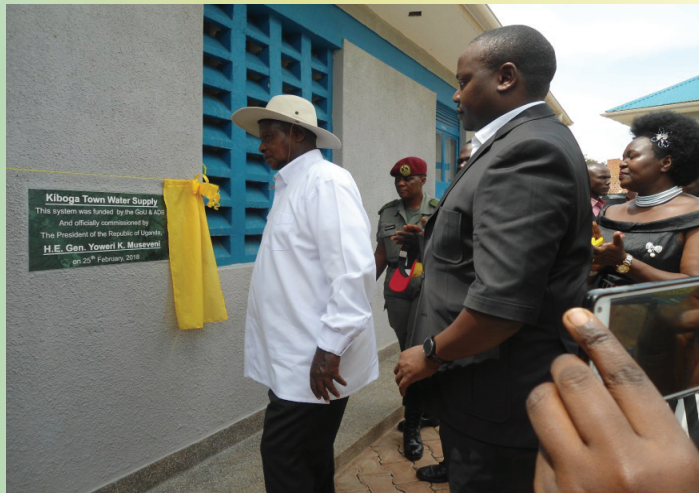
H.E commissioning the Kiboga Town Water Supply in Kiboga District

The Ministry rededicates itself to implementing the NRM manifesto 2016-2021 by increasing access to safe and clean water to all