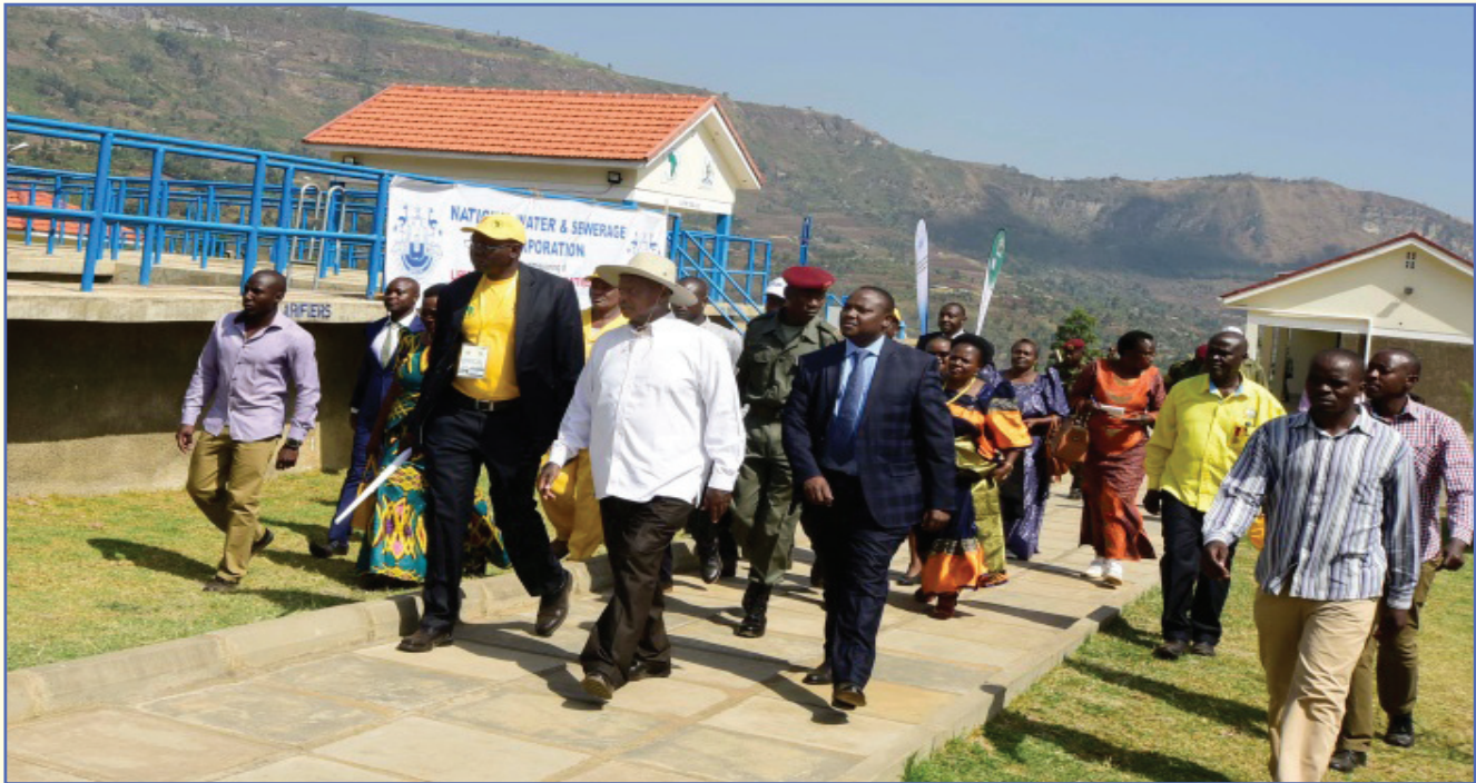
H.E Yoweri Kaguta Museveni inspecting the Lirima Large Gravity Flow Scheme in Manafwa District

1. In the water sector increased access to clean and safe water in rural areas within a radius of 1km has improved from 67% to 70% through development of solar powered mini piped water systems, construction of large Gravity flow schemes as well as construction of emergency pipe water supply systems. During the period of May 2017-May 2018, special attention was put on completion of projects, construction of the ongoing projects, carry out designs and procurement for new projects across the country.