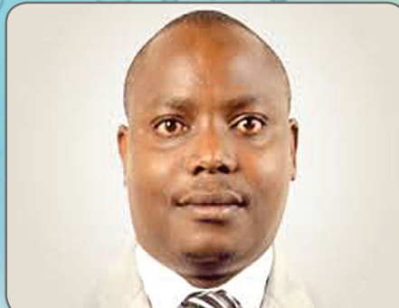
Hon. Ronald Kibuule Minister of State for Water Resources