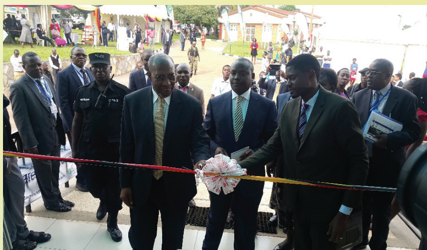
Rt. Hon Prime Minister Dr. Ruhakana Rugunda launching the Water Resources Institute during the Uganda Water and Environment week

The institute is currently hosted and housed in the current premises of the Directorate of Water Resources Management in Entebbe and was officially launched by the Rt. Prime Minister of Uganda, Dr. Ruhakana Rugunda on 21 st March 2018 during the Uganda Water and Environment Week.