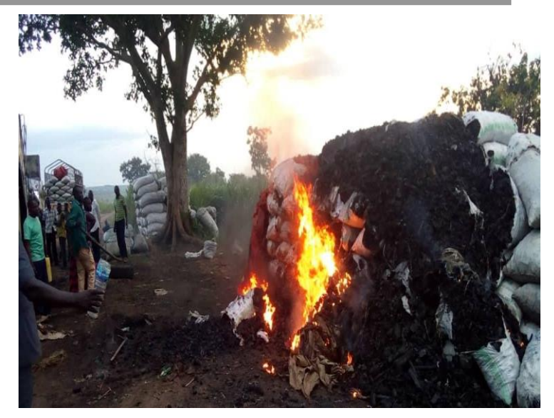
Figure 3: Torching of illegally produced and marketed charcoal in Abim district.

viii) Delays in finalizing of the National Climate Change Bill as a modality for implementation/enforcement to address climate & ENR issues and impacts of climate change on community and national development.