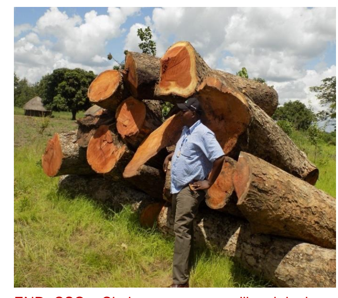
ENR CSOs Chairperson on an illegal loging tracking mission (together with NFA staff) in Palabek Ogili, Lamwo District.

Source: ENR-CSOs Annual Performance Report, 2018.