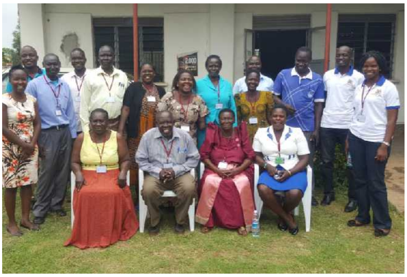
Participants of the Sanitation Governance Training in Apac Municipal Council