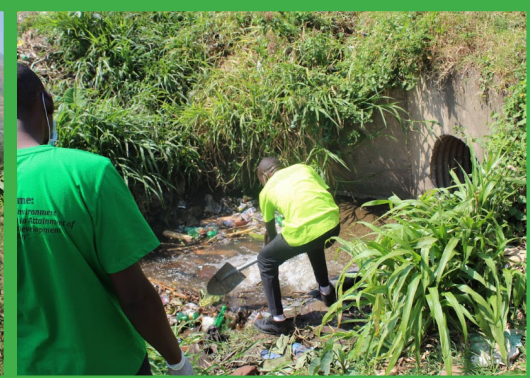
Cleaning up Karago Town Council in Kicwamba, 12 March

Kicwamba led the operation to demolish latrines that were in very poor and dangerous condition.