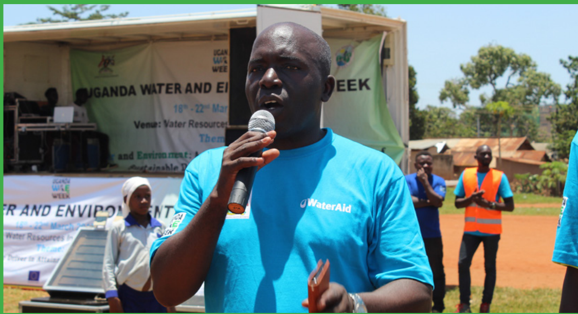
Mayor De Paul Kayanja addresses the public at Kiwafu Primary School, Kitooro