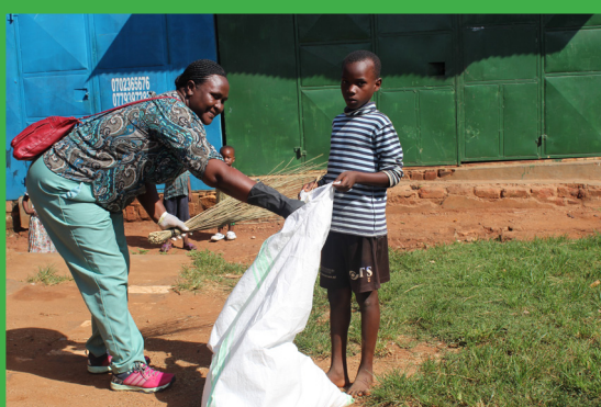
CAPTION: These are various moments from the clean-up exercise in Entebbe Kitooro, 16 March. The event attracted staff from DWRM as well as community members.