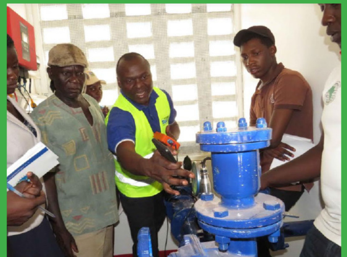
ABOVE: A demonstration of how the system works