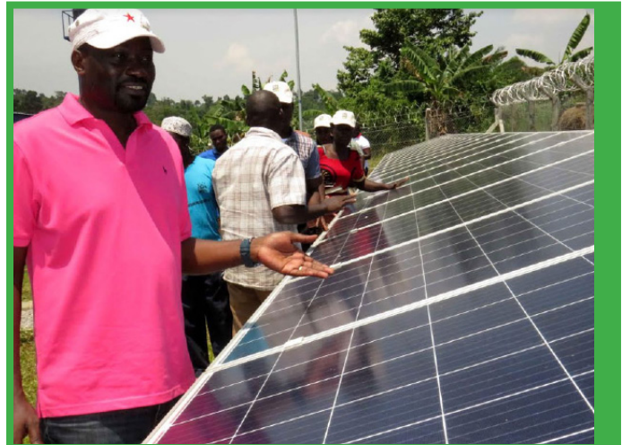
Solar panels powering Masulita piped water project

“Everything installed is very durable and at the moment we are test running the project where the locals are able to access free water for some time before a fee is introduced to enhance proper sustainability and management of the project including expansion,” Walusimbi said.