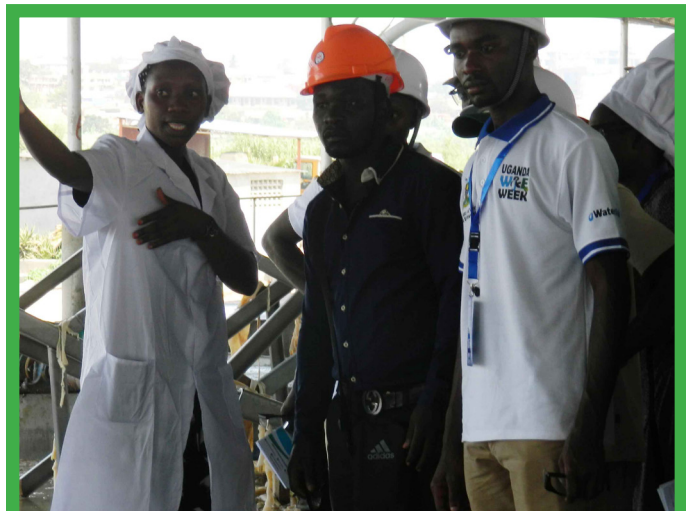
ABOVE and BELOW: UWEWK delegates are taken on a guided tour around the wastewater treatment facility at Sky Fat Leather factory

Perhaps most importantly, the company is now an example of an enterprise living in harmony with the locals and the environment. They proudly share their experiences without fearing that NEMA will come clamping down on them. They happily hosted a group of UWEWK participants who visited the factory to learn of their good practices in waste water management.