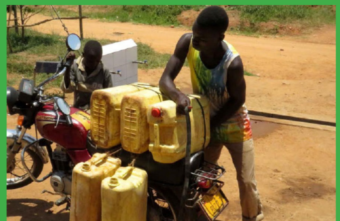
LEFT and ABOVE: Residents of Masulita enjoy a reliable water supply service.