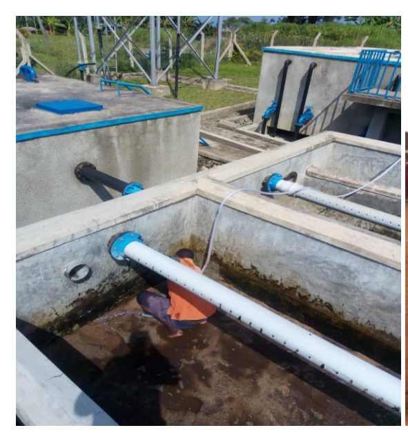
Cleaning of filtration chambers in Nyahuka to ensure supply of safe & clean water to