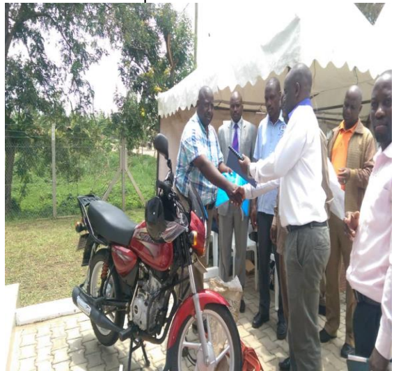
The Manager mwUws receiving tools & equipment for management of Kainja town from the Manager – WSDF-SW