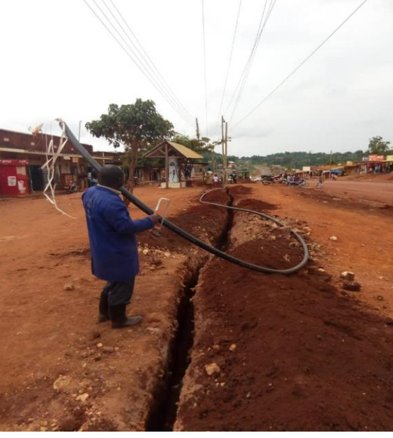
Extension of water in Mabaale town