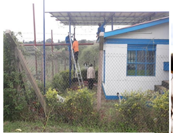
Installation of solar system on one of pump stations in Biguli-Kirinda town, Kamwenge district