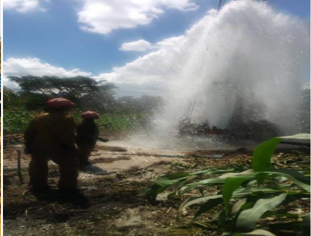
Drilling of a production borehole in Bukuya town, Mubende district in order to boost water supply in the area