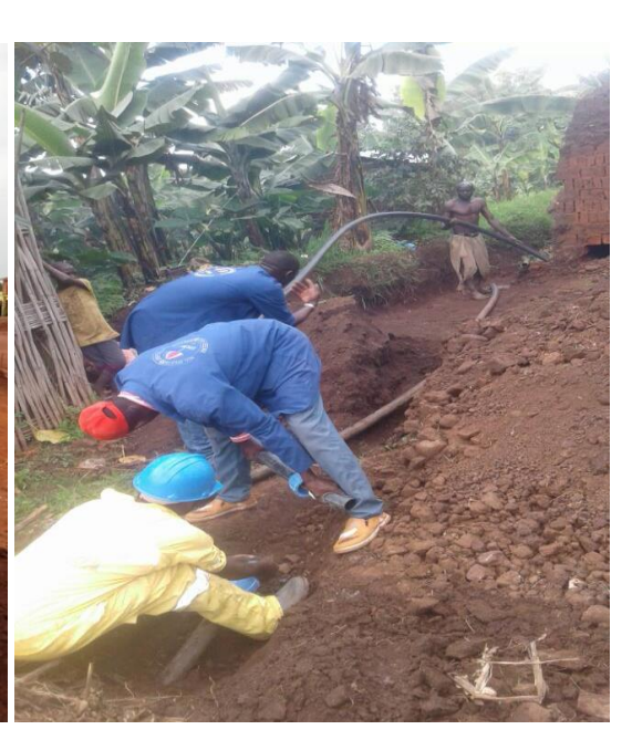
Extension of water in Buheesi town