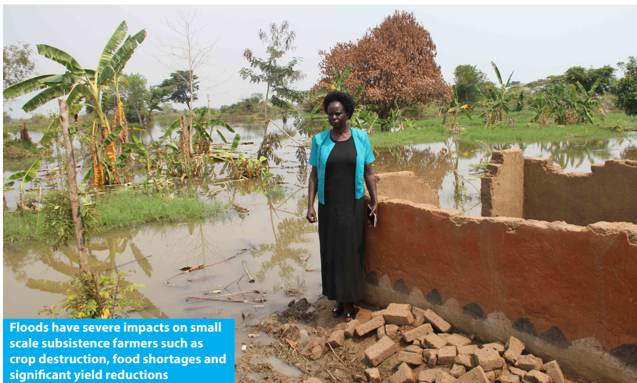
Floods have severe impacts on small scale subsistence farmers such as crop destruction, food shortages and significant yield reductions

Rescuing traditional management systems combined with the use of agro-ecologically based management strategies may represent the robust path to increase the productivity, sustainability and resilience of peasant-based agricultural production under unpredicted climate scenarios. It is, therefore, recommended that timely and good information is made available to farmers. and financial support to improve crop production through organic agriculture.