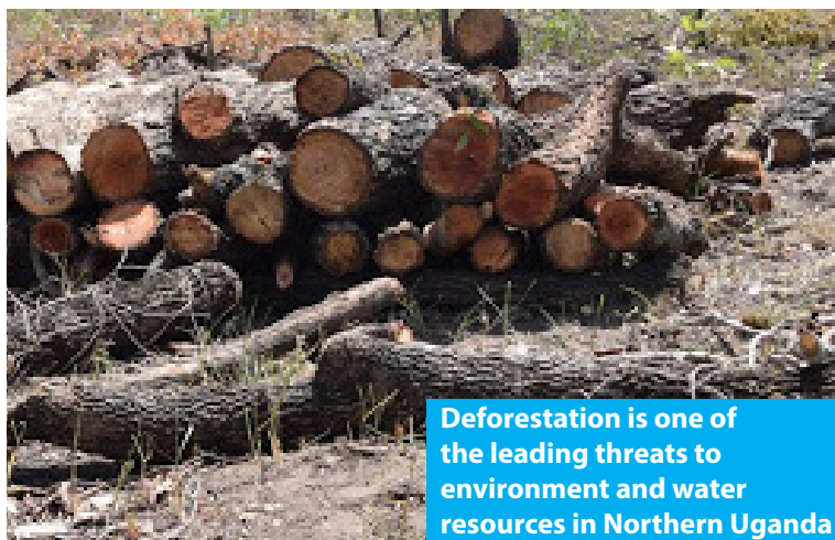
Deforestation is one of the leading threats to environment and water resources in Northern Uganda

We should also begin to look at organic waste, farm waste, charcoal dust and saw dust to make briquettes to reduce the demand for firewood. If deforestation continues at this rate, Uganda will lose all its forested land by 2050, causing loss of soil fertility and this will lead to famine, spread of diseases and drought.