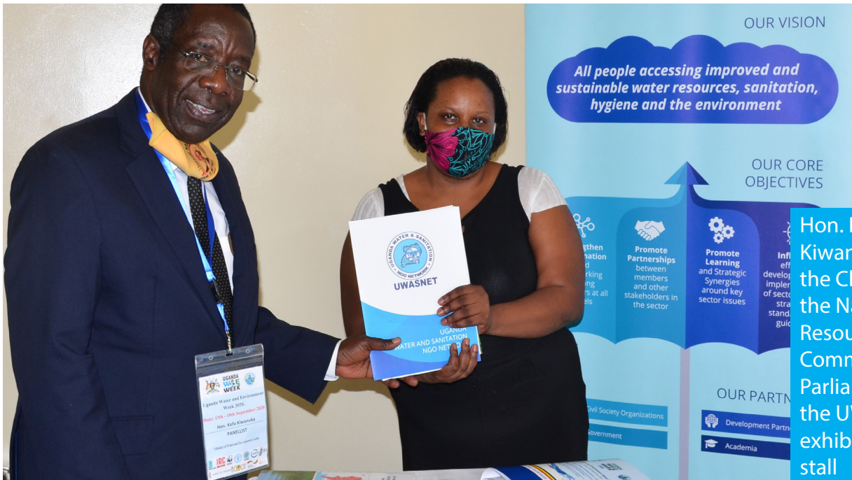
Hon. Keefa Kiwanuka, the Chair of the Natural Resources Committee of Parliament at the UWASNET exhibition stall