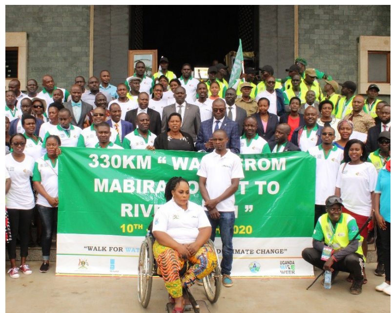
Walkers at Parliament in March 2020 (before COVID-19)