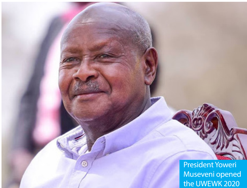
President Yoweri Museveni opened the UWEWK 2020