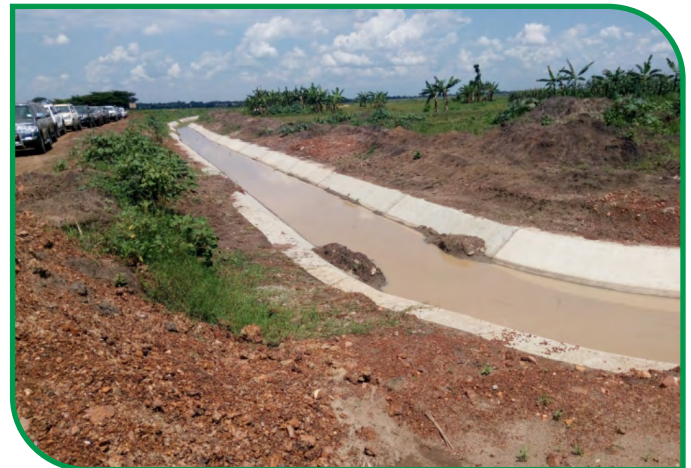
A section of secondary canal with concrete casting at Dobo II irrigation scheme, Butaleja district ■