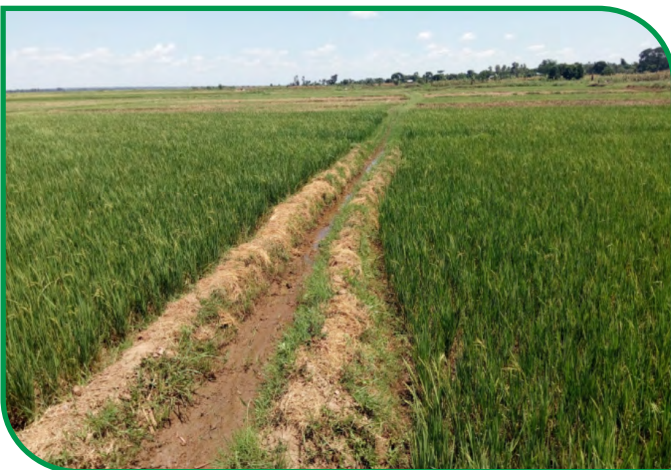
Rice field under irrigation at Dobo irrigation scheme, Butaleja district■