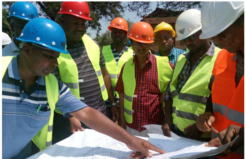
AfDB mission, project management team and contractors reviewing the construction map of Wadelai irrigation scheme

“The overall impression of the mission is that FIEFOC-2 project