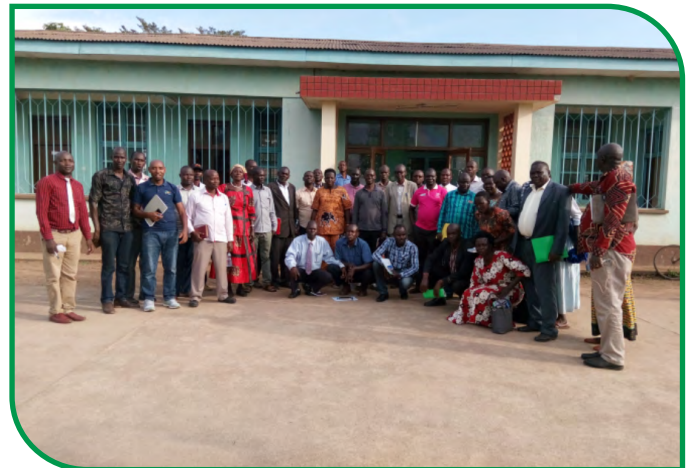
A delegation from Oyam district, comprising district leaders and farmers during an exposure visit on rice production at Dobo Irrigation Farmers Cooperative Society Headquarters in Butaleja district■