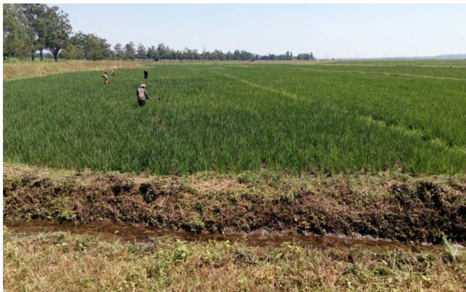
Rice production under irrigation scheme ■

The survey further indicates that the national average yield of rice production is two metric tons per hectare, while the average yield for the watersheds under study ranges