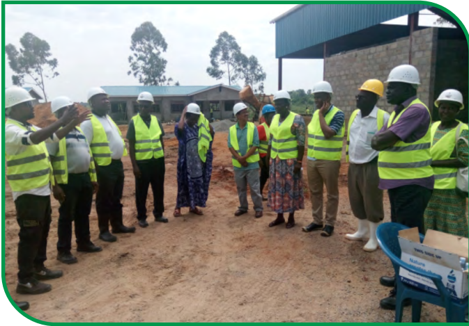
AfDB mission and project management team preparing for field inspection at Tochi irrigation scheme, Oyam district ■