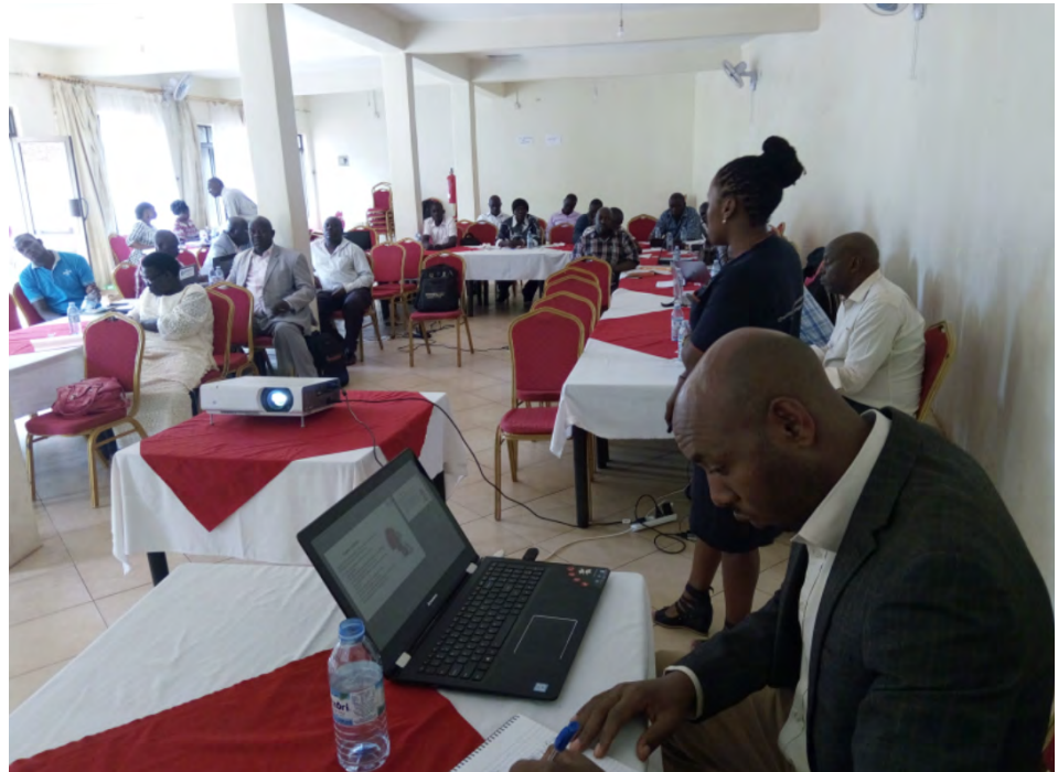
A cross section of key stakeholders from Oyam district during agribusiness planning meeting in Lira district ■

The component aims at increasing business outlook of the project beneficiaries toward increasing household incomes. It also comprises alternative livelihoods development that support activities to promote aquaculture within irrigation schemes, apiculture within the watershed area, seed production and marketing, as well as support activities that address youth unemployment through innovative agribusiness.