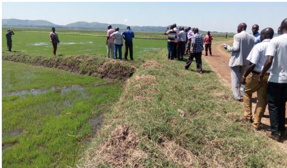
Oyam district leaders on exposure visit to Kibimba Rice Scheme, Bugiri district ■