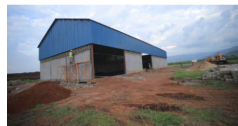
Storage facility under construction at Ngenge irrigation scheme, Kween district■