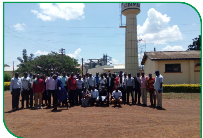
Oyam district leaders during a photo session at Kibimba rice scheme in Bugiri district■