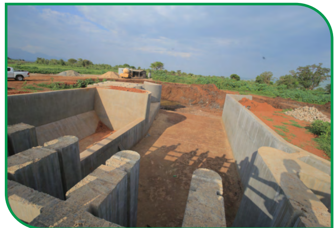
Kabajiria headworks under construction at Ngenge irrigation scheme, Kween district ■