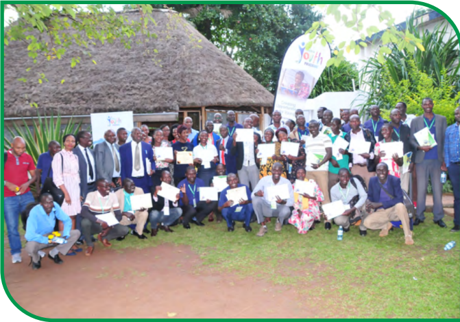
A group of 40 youth agripreneurs selected from Butaleja and Kween to benefit under EBABLE youth program having a photo session moment■