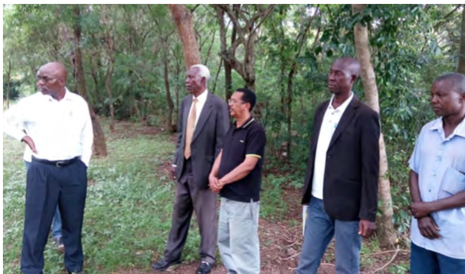
A team of AfDB mission on a visit to private natural forest owner ■

The once degraded hill is now restored and the entire landscape forested with scattered trees on farm and woodlots.