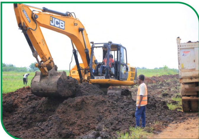
Excavation of main canal underway at Mubuku II irrigation scheme, Kasese district ■