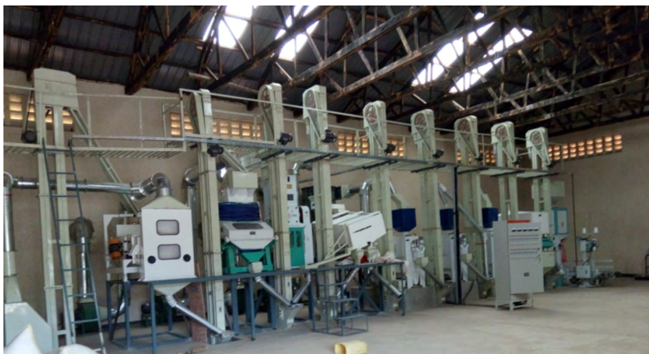
A newly installed rice milling machine at Manafwa Basin Rice Farmers' Cooperative Society Limited, Dobo Irrigation Scheme in Butaleja district. It mills 30 tons of rice per day■

Over the last decade, rice production has increased at an annual rate of 7.3 per cent.