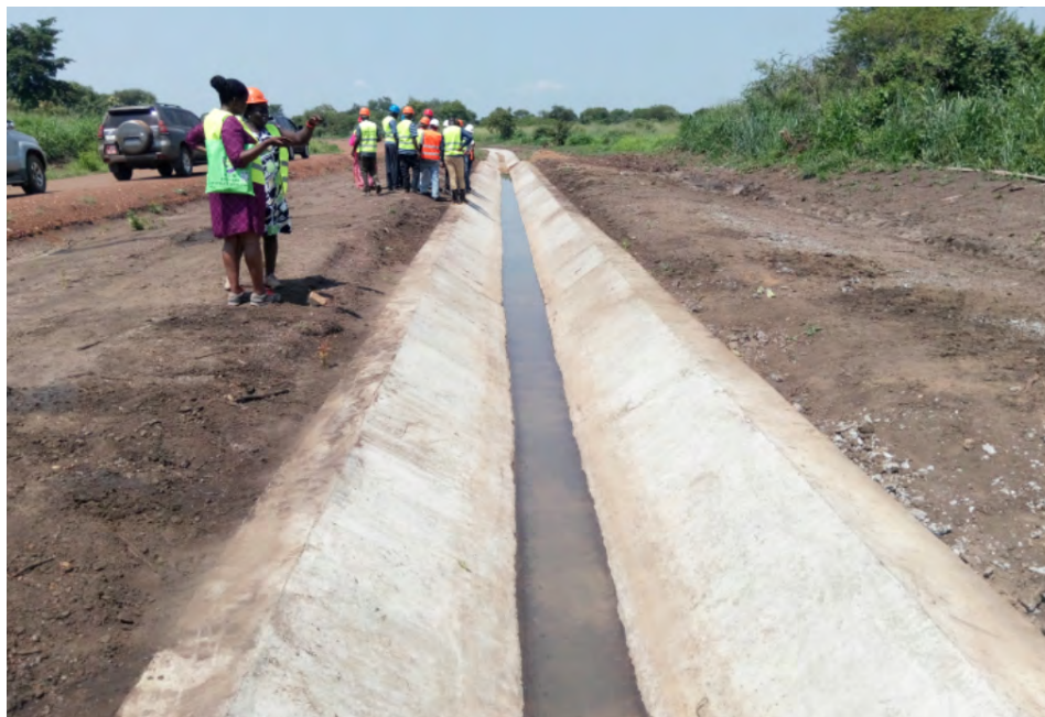
ADB mission inspecting one of the completed secondary canal at Wadelai irrigation scheme ■

To date, the scheme has registered an impressive progress. According to the Assistant Resident Engineer of