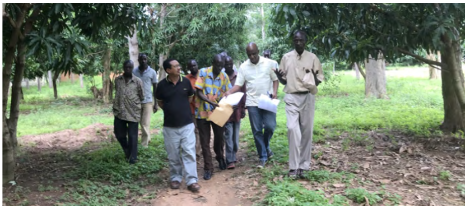
A team of AfDB mission touring one of the tree planning sites on Ayago hills ■

Seven years down the road, the once degraded hill is now restored and the entire landscape forested with scattered trees on farm and woodlots. “Fruit tree orchards were established specifically with mangoes, a private