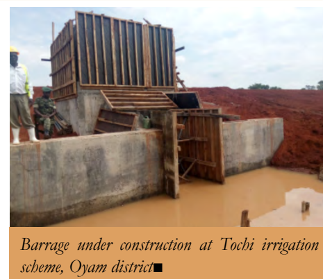
Barrage under construction at Tochi irrigation scheme, Oyam district■

When the schemes are fully operational, they will enable farmers to cultivate in two seasons and maximize their production■