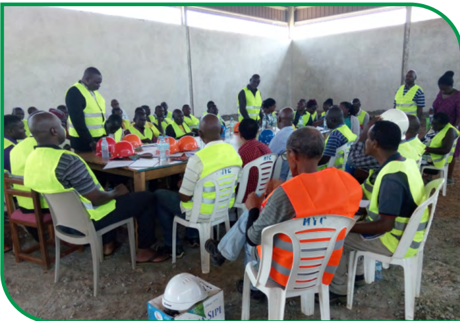
A team of AfDB mission and project implementation engaging communities from Wadelai in Pakwach district on development of irrigation scheme in the area■