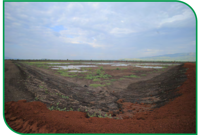
Night storage facility under construction at Ngenge irrigation scheme, Kween district ■